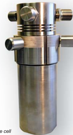
M7800 pressure cell Patent Pending