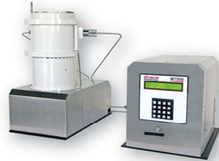
M7800 cell tower & M7500 control unit. Patent Pending

The M7800 is built with a thick-walled steel pressure cell, surrounded by a fail-safe steel containment vessel, to ensure operator safety.